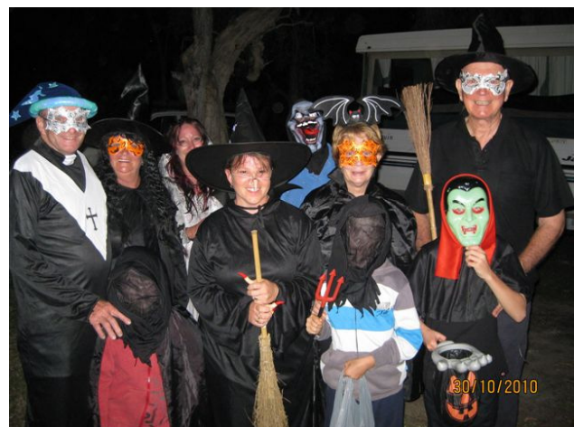
The excellent Halloween effort from all who participated!