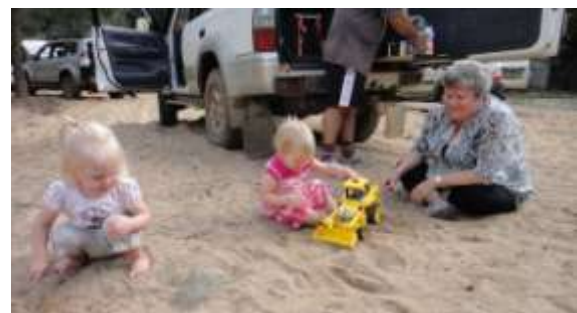
The kids enjoying the outdoors