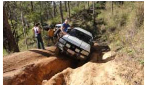
Derek VK dropped into a washout